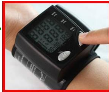
LCD Full Display