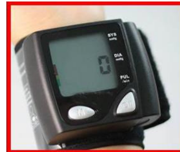
'0' will appear on the screen