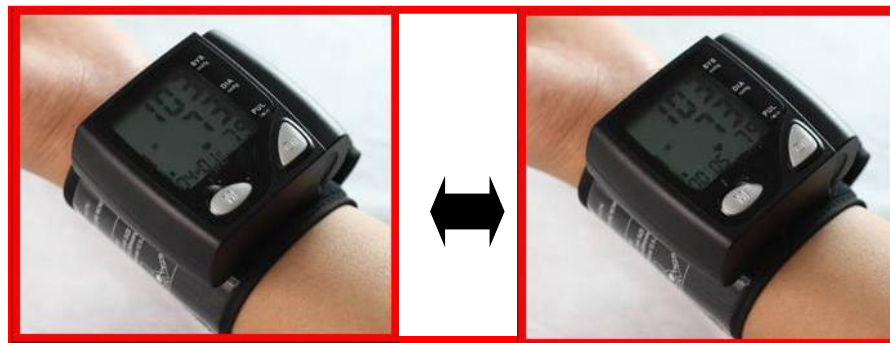
The results with measuring time display together in two screens alternately

When the measurement is finished, the value is recorded automatically