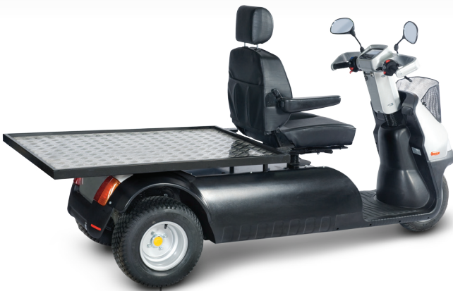
Afiscooter-M Extended loading surface