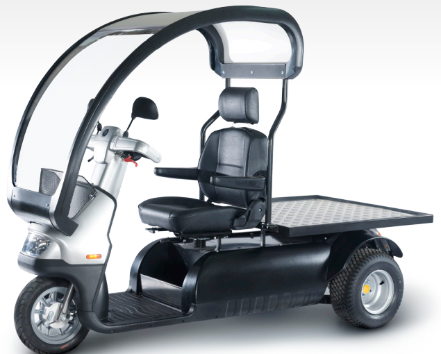
Afiscooter-M Loading surface with canopy

Afikim Electric Vehicles develops and manufactures advanced, electrically-powered mobility scooters since 1978. Afiscooters' mobility scooters are designed with reliability and driver safety in mind. Our worldwide distribution network offers year-round local technical support. Afikim Electric Vehicles meet European ISO 9001-2000, EN-12184 certification, and US safety standards with FDA approval.