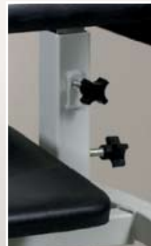
2 knobs lock chrome armrest into position