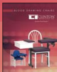
Blood Drawing Chairs