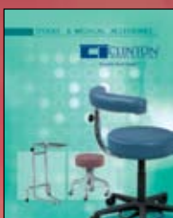
Stools & Medical Accessories