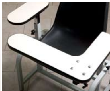
One-piece flip-arm with edge-bumper stripping