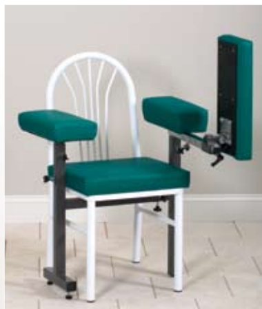
Arm flips clear for easy seating and exit