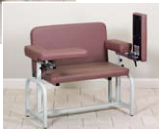
One arm in up position