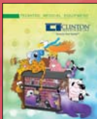
Pediatric Medical Equipment