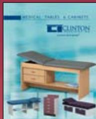
Medical Tables & Cabinets

See the entire Clinton product line. Call Clinton today for any of our product catalogs.