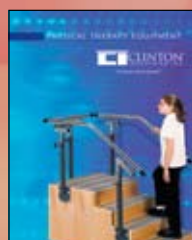
Physical Therapy Equipment