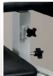
2 knobs lock chrome armrest into position