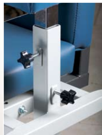
Two knobs securely lock armrest into position for safety