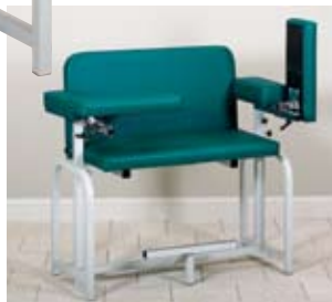
One arm in up position