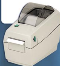
Model P220 Thermal Label Printer

11:23, 02/15/05 ID: 12548796 BMI: 28.6 Height: 6' 0.1" Weight: 212.4 lb G