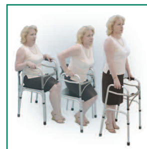
NEW &amp; IMPROVED FRONT CROSS FRAME!