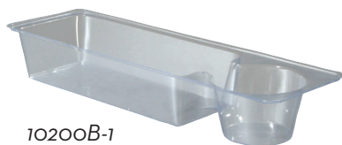
10200B-1 Additional Inserts Sold Separately.