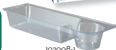
10200B-1 Insert Included! Additional Inserts Sold Separately.