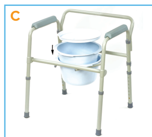
3. PART C DROPS INTO PART A