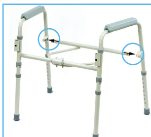
2. PART B SNAPS INTO PART A (SEE CIRCLES ABOVE).