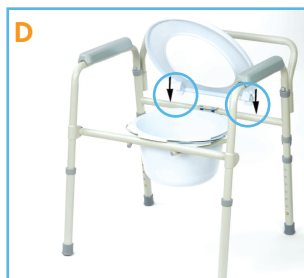
4. TWO SEPARATE PIECES OF PART D SNAP ONTO PART A (SEE CIRCLES ABOVE).