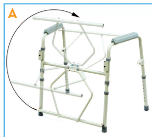
1. PART A OPENS UP AND ASSEMBLES (SEE CIRCLES ABOVE).