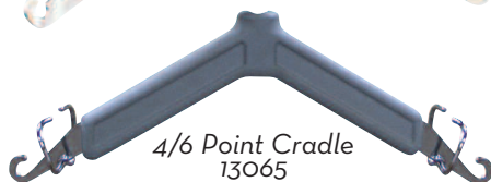
4/6 Point Cradle 13065

13240SB 1/bx (For use with old style 13010 patient lift)