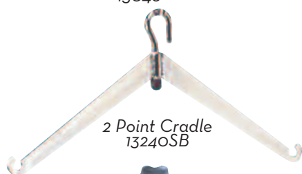
2 Point Cradle 13240SB

13046 1/bx (For use with patient lift) Can Be Used with Most Manufacturers Lifts. Weight Capacity 600 lbs., 1 Year Limited Warranty.