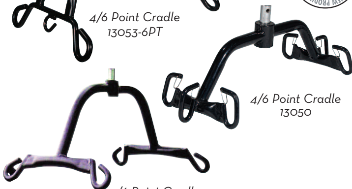
4/6 Point Cradle 13050

13053-6PT 1/bx (For use with 4 and 6 point slings) Comes Standard, 13010SV