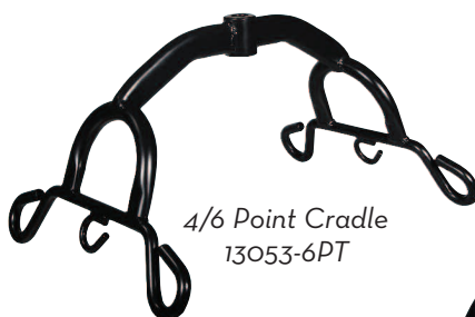
4/6 Point Cradle 13053-6PT

13065 1/bx (For use with 4 or 6 point slings) Comes Standard on 13023.