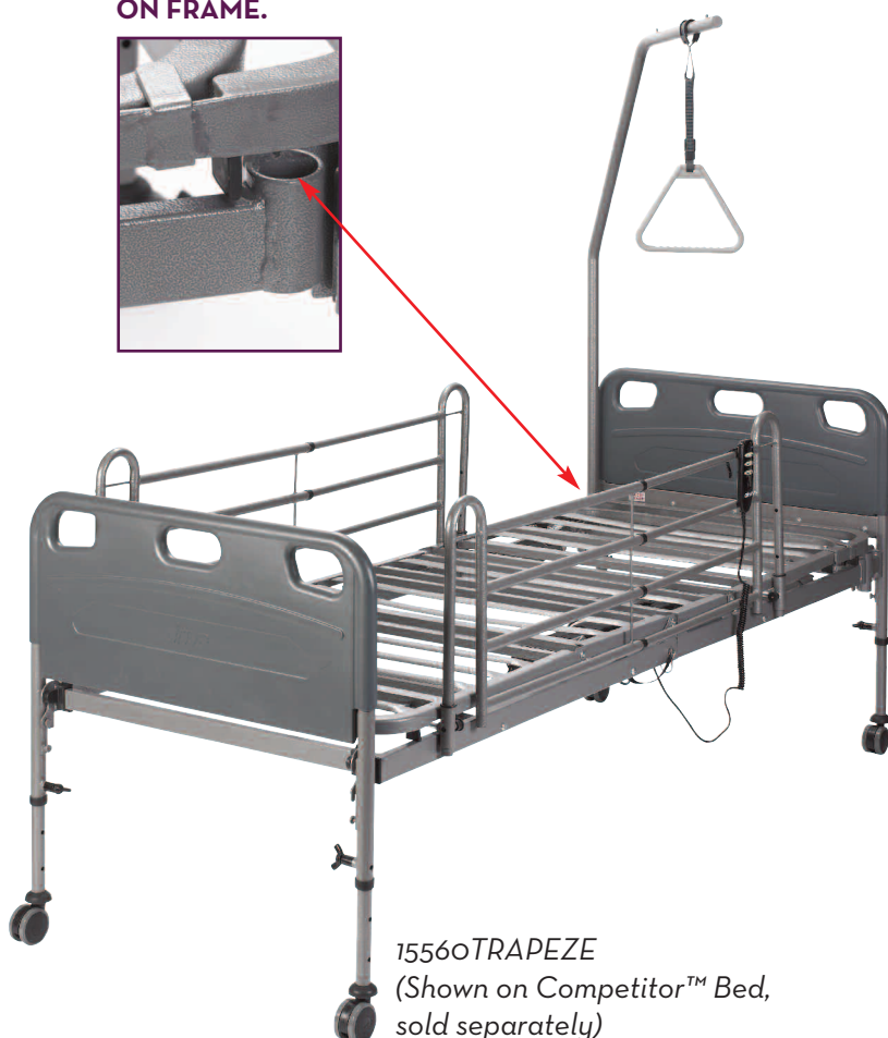
1556OTRAPEZE (Shown on Competitor™ Bed, sold separately)