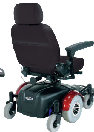
Image EC Mid Wheel Drive