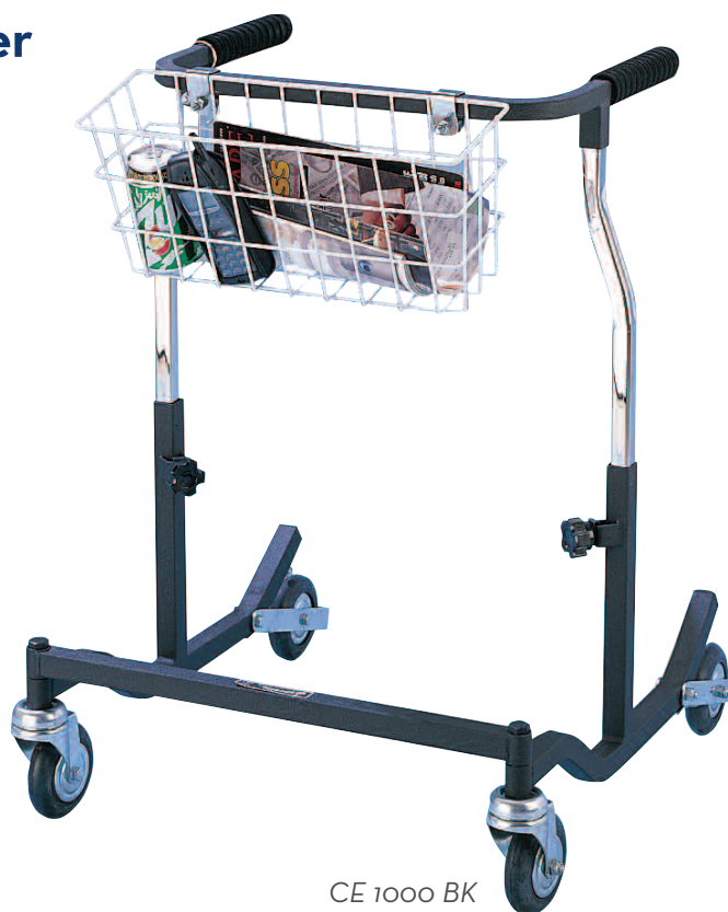
CE 1000 BK