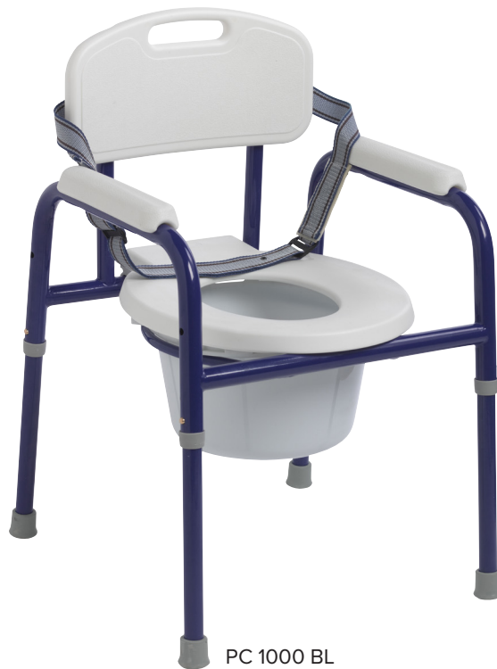
PC 1000 BL