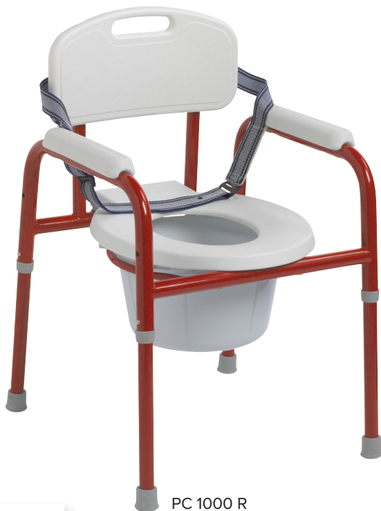
PC 1000 R