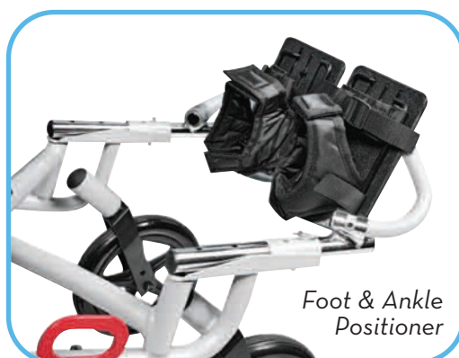
Foot & Ankle Positioner