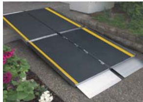
Bottom transition plates adjust to uneven terrain