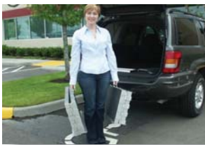
Separates for transport and storage