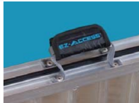
Ergonomically designed handles offer convenient carrying and a comfortable grip