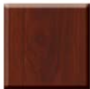
Cherry Mahogany (CM)

Additional Wood Look Option Available, #WV540PC-CM Vinyl Coated Aluminum