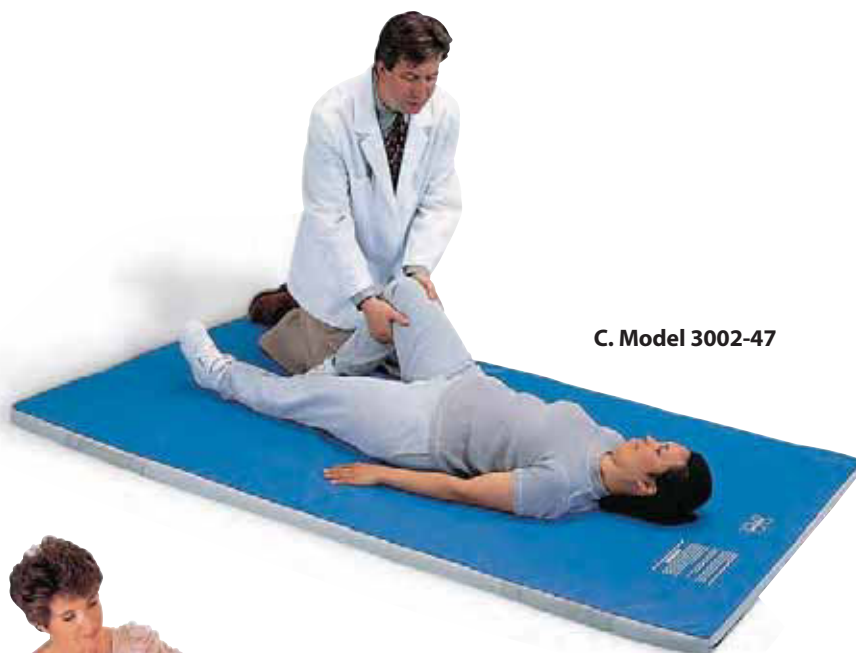
C. Model 3002-47