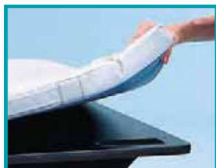
C. 3002-57 Mat attached with VELCRO® brand fasteners