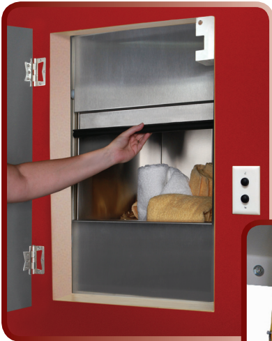
Shown in optional Stainless Steel finish