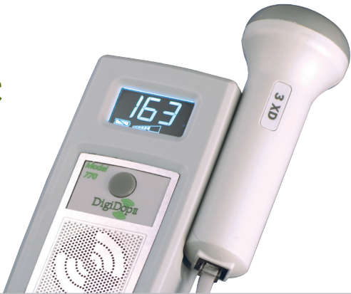
Table top or wall mount version

Our premium rechargeable batteries stay charged for years when not in use and can be recharged more than 2000 times. A significant cost savings and reduction in waste.