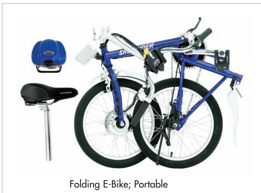
Folding E-Bike; Portable