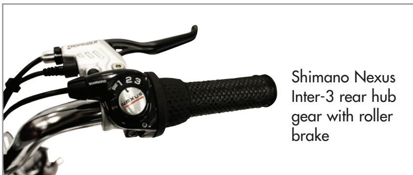
Shimano Nexus Inter-3 rear hub gear with roller brake