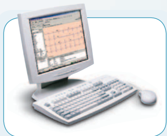
Welch Allyn CardioPerfect™ Workstation