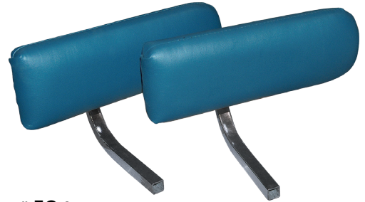
Item # FC 8027 Shown